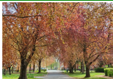
(Cranwell Road)