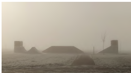
Foggy Skate Park