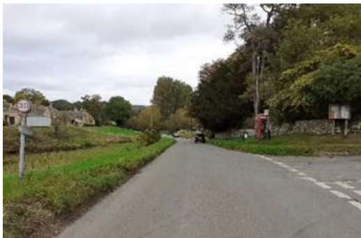
The road through Little Barrington - not quite the A40!

It is now apparent that the minor road that runs through both Great and Little Barrington is the increasingly-preferred route for the largely local population commuting between Lechlade and Stow, who wish to avoid the bottle-neck of Burford, and many residents of the Rissingtons also, understandably, access the A40 via the Barringtons.