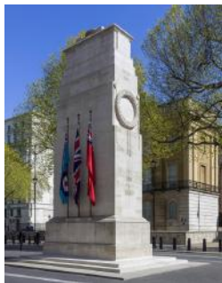
Cenotaph in Whitehall

Before the end of the First World War, he was appointed one of three principal architects for the Imperial War Graves Commission (now Commonwealth War Graves Commission) and was involved with the creation of many monuments to commemorate the dead. Larger cemeteries have a Stone of Remembrance, designed by him. The best known of these monuments are the Cenotaph in Whitehall, Westminster and the Memorial to the Missing of the Somme, Thiepval.