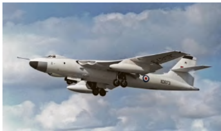
Vickers Valiant B.1 1962

The Valiant was the first of the V-bombers to become operational and was followed by the Handley-Page Victor and the Avro Vulcan. The Valiant was the only V-bomber to have dropped live nuclear weapons (for test purposes) and was the first of the V-bombers to see combat.