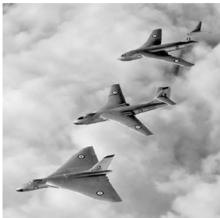
Britain's "V-Bomber" trio in flight 1957 – Vulcan, Valiant & Victor