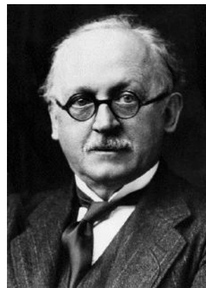
Sir Edwin Landseer Lutyens OM KCIE PRA FRIBA (29 March 1869 – 1 January 1944).

Lutyens' fame grew largely through the popularity of the new lifestyle magazine Country Life created by Edward Hudson, which featured many of his house designs. After about 1900 his Arts and Crafts style gave way to a more conventional Classicism, a change of direction which had a profound influence on wider British architectural practice.