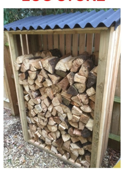
(takes just over 1 cubic metre of wood) £180 plus VAT Other sizes available to order