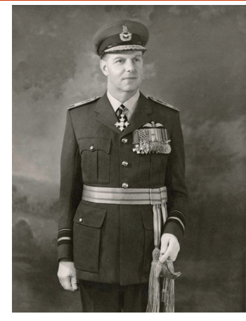
circa 1960s

In March 1946 he was appointed to a Permanent Commission in the rank of Flight Lieutenant. In 1948 he became Squadron Commander at the CFS, shortly thereafter joined the Staff at HQ Flying Training Command. In 1953 he returned to CFS as Chief Flying Instructor.