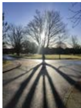
Long Shadows (Farman Crescent)